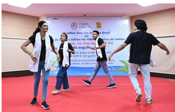
Figure 5: Nukkad Natak on Water Conservation by Awaz Group