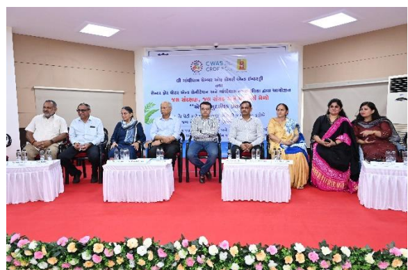
Figure 1: Jal Snarakshan Mela – Inaugural Ceremony

The “Jal Sanchay Jan Bhagidari” initiative seeks to involve citizens in water conservation through collective actions like Rainwater Harvesting (RWH) and Groundwater Recharge (GWR). Similarly, the Jal Sanrakshan Mela focused on raising awareness about these critical measures, offering practical solutions for local implementation. This innovative open platform aimed to raise awareness about the importance of water conservation through Rainwater Harvesting (RWH) and Groundwater Recharge (GWR) and for showcasing practical solutions that can help in water conservation. It was a one stop destination, where local residents of Gandhidham/Anjar could come and meet various technology suppliers and innovators working in the field of water conservation and explore the potential of implementing these solutions in their local context.