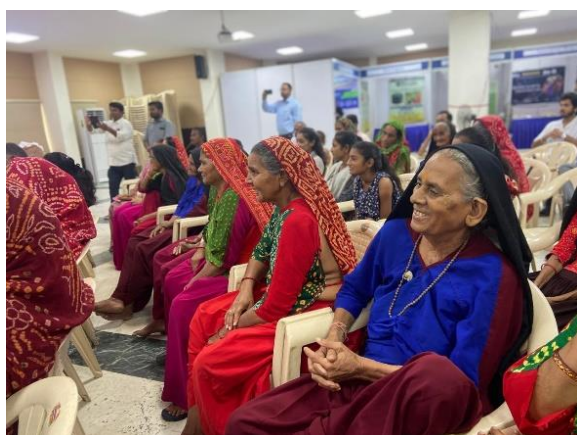
Figure 6: Villager at the Mela

The two-day Jal Sanrakshan Mela in Gandhidham was a significant step towards fostering a culture of water conservation along with reinforcing the national agenda of “Jal Sanchay, Jan Bhagidari” set forth by H’ble Prime Minister of India. By bringing together service providers, product suppliers, policymakers, and community members , the event created a platform for knowledge exchange and collaboration . The enthusiastic participation and positive feedback from attendees highlight the event's impact in promoting Rainwater Harvesting and Groundwater Recharge. Moving forward, we plan to organize this as an annual event with GCCI and GMC and also explore partnerships with other organizations to organize such events which play a crucial role in creating awareness around sustainable water management practices