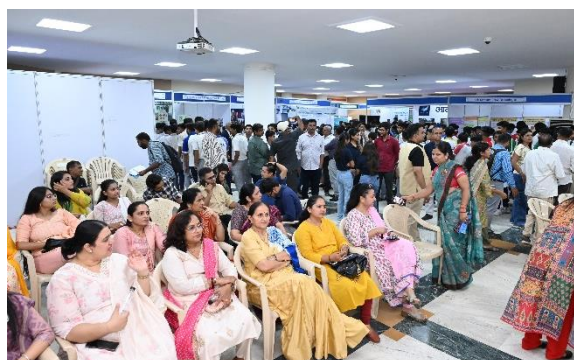
Figure 4: GCCI Women Cell Members