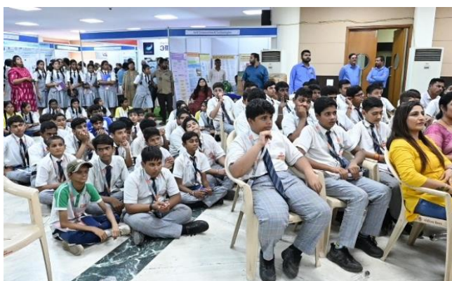
Figure 3: School Students engrossed in the Nukkad Natak at the Mela