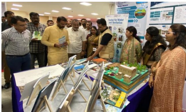
Figure 2: MP, Shri. Vinod Chawda at CWAS Stall

One of the highlights of the event was the Nukkad Natak, a traditional street play organized to convey the message of water conservation engagingly and entertainingly. This play not only captivated the audience but also effectively communicated the importance of becoming water secure. The use of performing arts to spread awareness added a unique dimension to the Mela, making it accessible and memorable for all attendees.